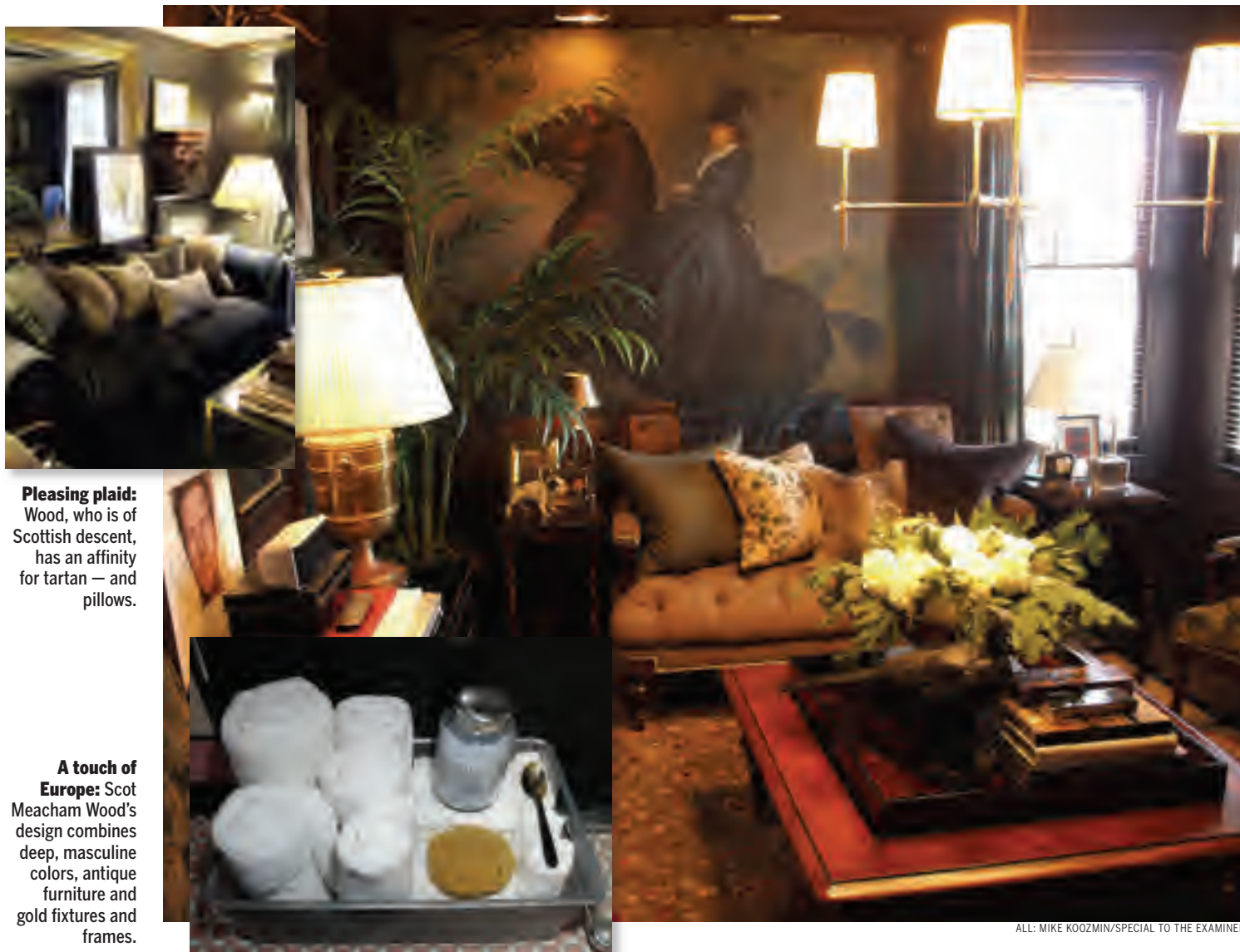
Pleasing plaid: Wood, who is of Scottish descent, has an affinity for tartan — and pillows.