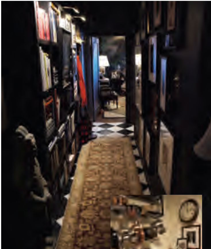
Old and new: Wood combines modern and traditional elements in his home.